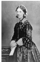
Florence Nightingale (1820-1910)

In History this half term, we will be learning about Florence Nightingale and Mary Seacole. We will investigate the events of the Crimean War and the actions of these two significant historical figures. The children will compare the two nurses and consider their impact on how the nursing profession looks today.