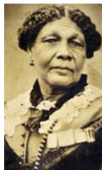
Mary Seacole (1805-1881)